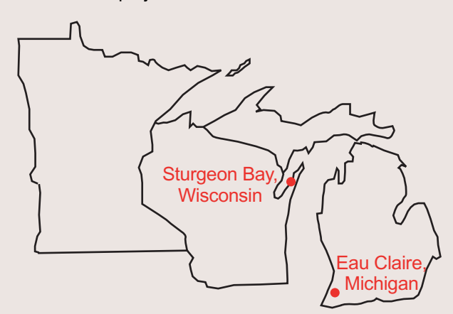
Figure F7.1: Recently evaluated VEMAP data using the CGCM1 and HadCM2 models at two locations: Eau Claire, Michigan and Sturgeon Bay, Wisconsin.

Large changes in the threshold parameters are suggested by the scenarios for the 2090-2099 decade. Projected changes are considerably greater for the CGCM1 scenarios compared to the HadCM2 scenarios. Also, the projected changes are larger at Eau Claire than at Sturgeon Bay. The dates of last spring freeze at the two locations are projected to occur between 17-36 days earlier than at present. The projected change in the date of first fall freeze is somewhat smaller, between 4-23 days, depending on which scenario and location. The HadCM2 scenarios suggest that critical growth stages will occur 11-16 days earlier, whereas the CGCM1 scenarios suggest a 9-27 day change at Sturgeon Bay and a much larger 41-45 day change at Eau Claire. The HadCM2 scenarios project that seasonal GDU accumulations at the two locations will be 20% larger than present-day values, and the CGCM1 scenarios project a 50% increase. Similar to the 2025-2034 period, the projections of overall suscep-